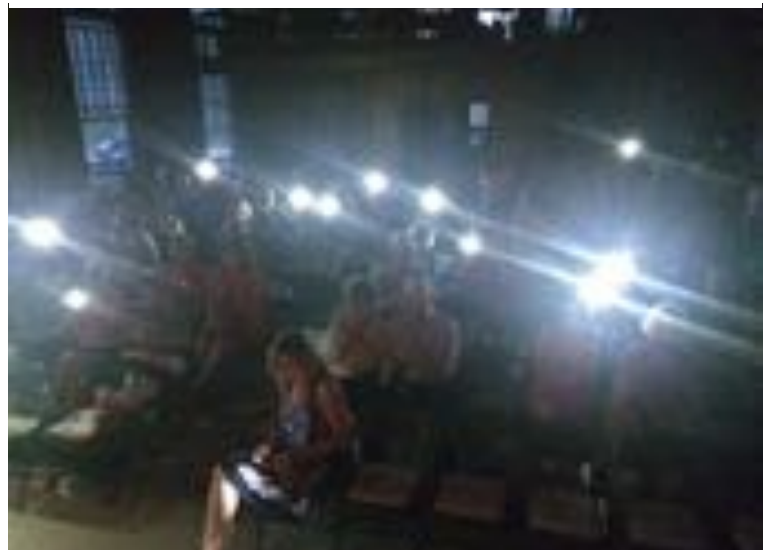
Photo Credit 2. Bill Milford (taking photo of Joann & the Fireflies)